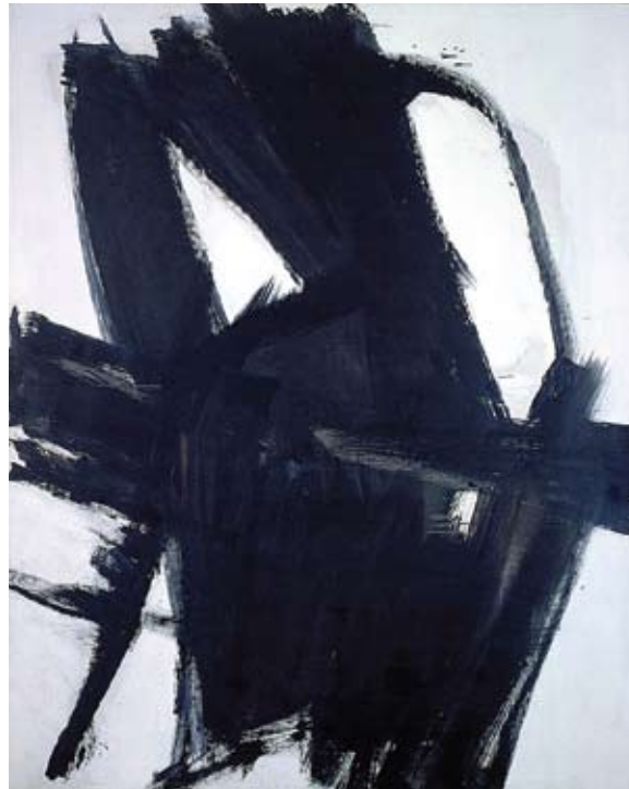
FRANZ KLINE ◀ Merce C

Merce Cunningham—a modern dancer, choreographer, and friend of the artist—inspired Franz Kline’s own dynamic performance in black and white. In this stark but dramatic composition, Kline captures the power and elegance of Cunningham’s dances. Third Floor, Contemporary Art